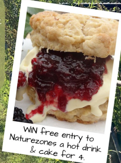
WIN free entry to Naturezones a hot drink & cake for 4.

3 prizes, one each for the most informative piece of writing, the greatest increase in effort shown, and for the most learnt while completing the mission.