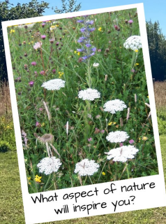
What aspect of nature will inspire you?

Will yours be interactive, digital, written or maybe art work?